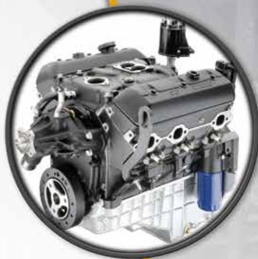
GM 4.3L V6 engine

The Yale® Veracitor® VX series offers a variety of productivity options, all featuring the GM 4.3L V6 engine or Kubota 3.8L turbo diesel engine. Two transmission selections are available: the Electronic Powershift and the Techtronix 332.