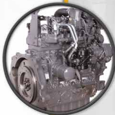
Kubota 3.8L turbo diesel engine

The Electronic Powershift features two-speed forward and two-speed reverse transmission and hydraulic inching. Both transmissions feature smooth inching, electronic shift control and neutral start/brake interlock.