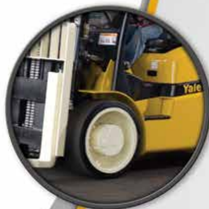
Auto Deceleration System

The optional Techtronix 332 transmission features three-speed forward and two-speed reverse for additional travel speed and gradeability, controlled ramp descent, limiting roll to three inches per second, electronic inching (requires no adjustment), and the Auto Deceleration System, bringing the unit to a complete stop when the accelerator pedal is released. Tire spin is reduced by precisely regulating engine speed during controlled power reversals.