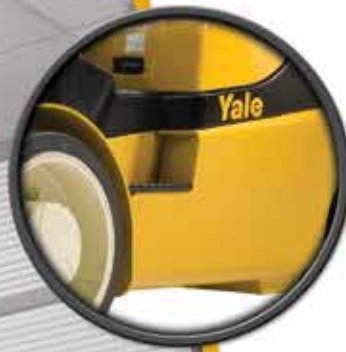
Low step height