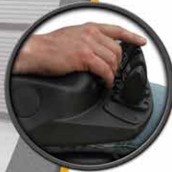
Ergonomic hydraulic controls