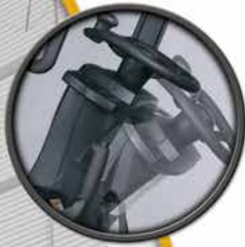
Infinitely adjustable steer column