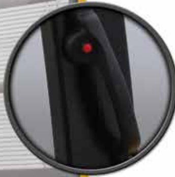
Optional rear drive handle